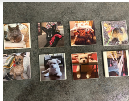
A selection of the coasters created at the Rainbow Bridge Remembrance Day memorial event, Aug. 21.