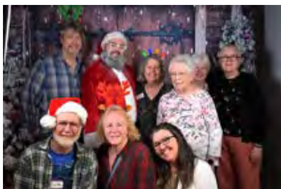
Relaxation Team at the Christmas Open House