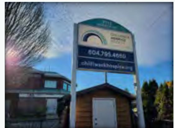
The new logo features the graceful arcs of a bridge—a meaningful symbol of connection, resilience, and transformation.