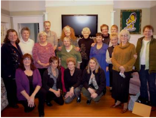
Fall 2010 First Step Grief Group Photo

Our Fall First Step Group finished up on Dec. 6 th . We had an average attendance of 17 wonderful people who courageously came together to share their stories of loss and those who would like to, will continue on with the Second Step Group. The Second Step Group meets the first Friday of the month for a social luncheon and the third Friday of the month for a meeting. For more information, please contact our office.