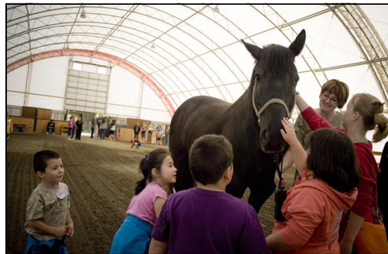
Horse Whisperer Grief Camp June 2010